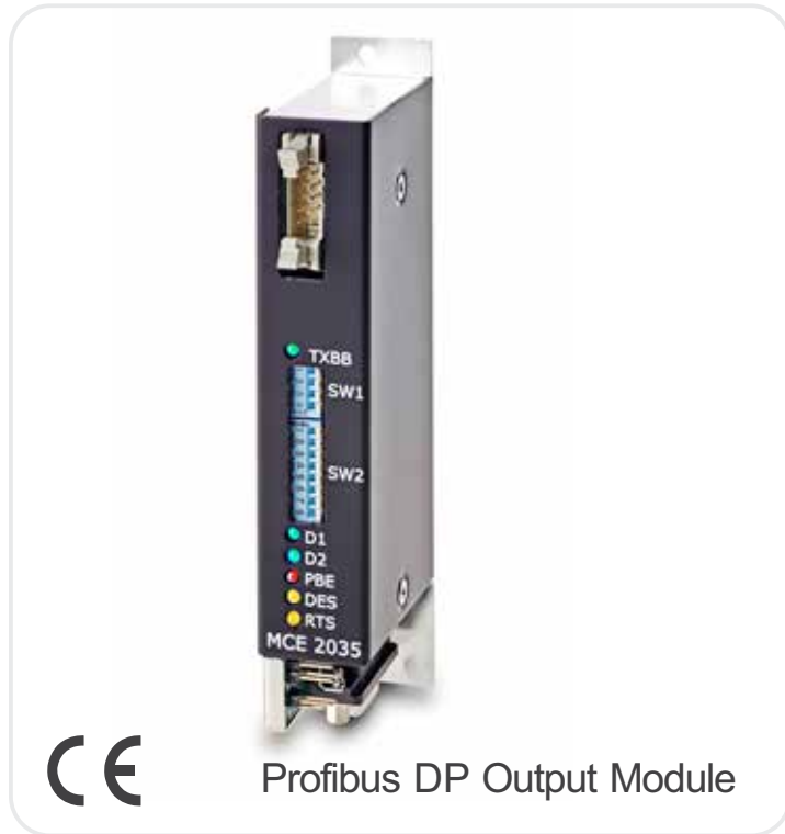
Profibus DP Output Module